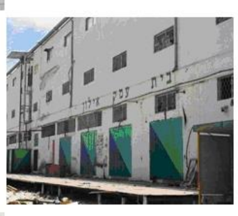
The Erez Industrial Park