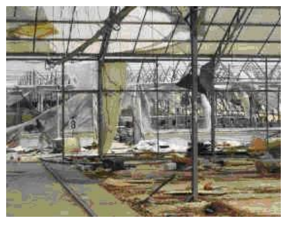
One of the destroyed greenhouses

All these positive efforts were unfortunately thwarted. The GIE zone became the